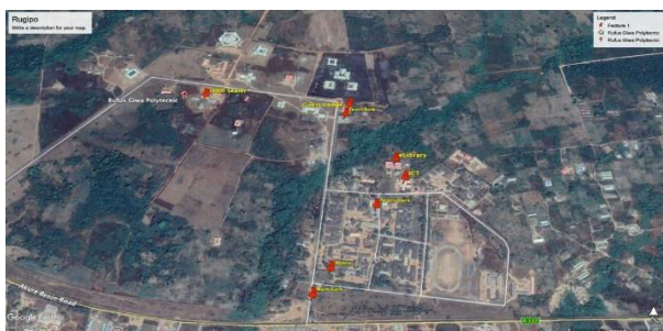
Fig. 2 Google-earth view showing AP locations (pin points)

Each AP is connected directly to the trusted (sector antennae) infrastructure at the NMC to provide wireless connection to configured station (terminal, mobile and portable devices). Distributed processing technique has an advantage of collaboration using an extension approach to