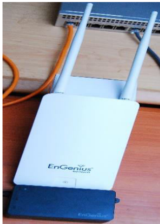
Fig. 1 aii EnGeniusENS 202 EXT AP with external antenna