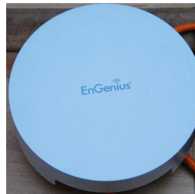
Fig. 1ai EnGenius EWS333 AP with built-in antenna

The physical structure of the full series EnGenius AP configuration parameters and accessories with built-in and external antenna depicted the simple format with easy-to-connect features as shown in fig. 1ai (built-in) and 1aii (external) respectively.